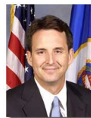
Governor of MN Tim Pawlenty tim.pawlenty@state.mn.us